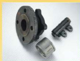
Casting and Mold