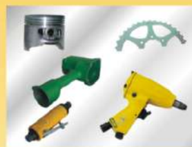
Tool and Tooling